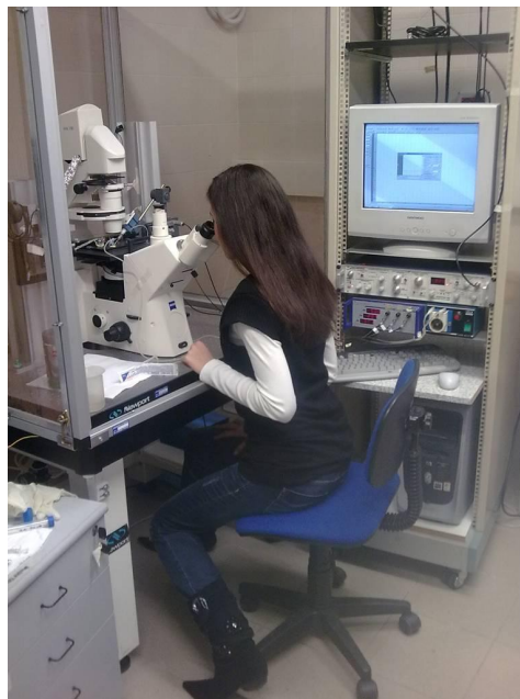
Fig.3. Me, doing experiments, in the Laboratory of Biophysics and Cellular Neurobiology at the BRAIN Center for Neuroscience and Department of Life Science at the University of Trieste.