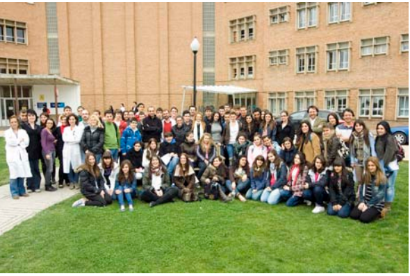
Students and scientists after students visit to HNP labs