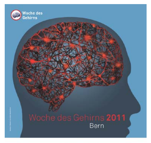
Abendforen und Film 14. bis 18. Marz 2011 Universität Bern, Hauptgebäude Eintritt frei www.brainweekbern.ch

The movie «Eternal Sunshine of the Spotless Mind» was also shown at a movie theatre. In coincidence of the Brain Week with the Bern's night of the museums, an exhibition about subjective views of psychiatric patients at the psychiatric museum Bern was showed. Furthermore, to encourage creativity, a drawing competition was arranged with the topic «brainwash».