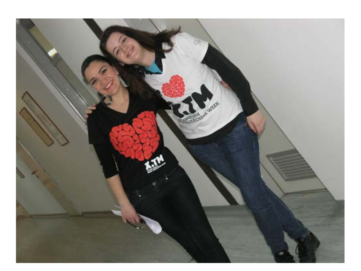
Participants wearing official t-shirts