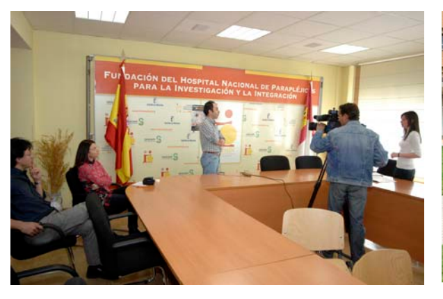
Local TV station interview with HNP scientists

This was the first time BAW activity was organized in the National Hospital for Paraplegics (HNP) with the goal of engaging and educating the community on the function and importance of healthy spinal cord and the contributions of neuroscience research in addressing functional deficits and treatments for the injured spinal cord. Thus, we organized movie projections and open forum discussions between the public and HNP scientists, visits to local elementary/high schools and the university as well as an interactive tour to the HNP laboratories where students spoke with scientists about the research, equipment and methodology. The event culminated in 2 talks by invited scientists about the brain and spinal cord, scientific advances and future directions for better understanding their function and repair. We reached over 400 people from different age groups and received multiple requests for more such events in the future. We had excellent press coverage, interviews in local radio/TV stations.