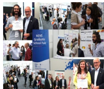
Best Poster Awards for the NENS Graduate School Fair at the 11th FENS FORUM (Berlin, Germany) in 2018.

Prize amount: EUR 1.000/awardee , FENS/NENS certificate