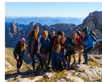
MSc student exchange from the Max Planck Research School Neurosciences (Göttingen, Germany) to the EDNE Doctoral Program in Neuroscience (Lausanne, Switzerland) in 2019.